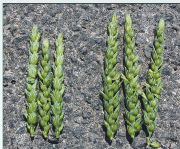
No TwinN, 180 kgN/ha TwinN + 90 kgN/ha